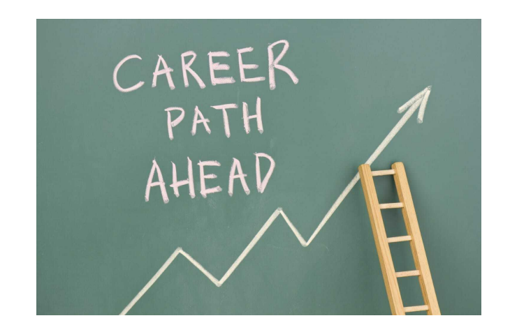
In-person, virtual, and hybrid workshops available!

Join us for an Information Session Grant Money for School & Training <u>Tuesday, October 18, 2022 at GSU</u>